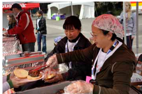
Volunteers serve lunch to hungry Walkers

Don't just stand there! Join us for this year's walk and see how your support makes a difference. We look forward to seeing you on September 12th.