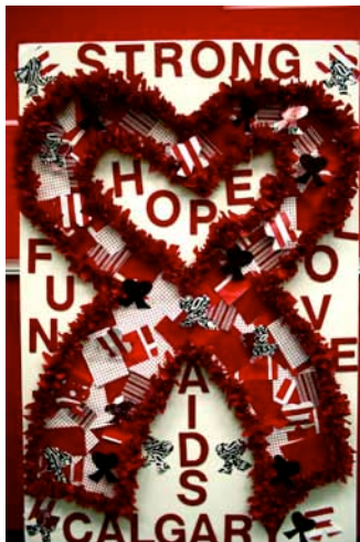
Volunteer Challenge participants created an AIDS ribbon from different materials to symbolize the diversity of the individuals who utilize services at AIDS Calgary or take part as volunteers.