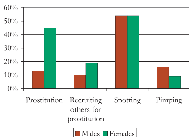
Figure 2: Prostitution-Related Activities by Gender

Based on a sample of 108 to 152 street-involved youth in Calgary.