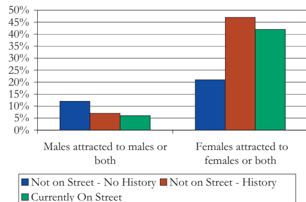
Figure 1: Physical Attraction by Current Level of Street Involvement

Based on a sample of 132 female and 208 male street-involved youth in Calgary.