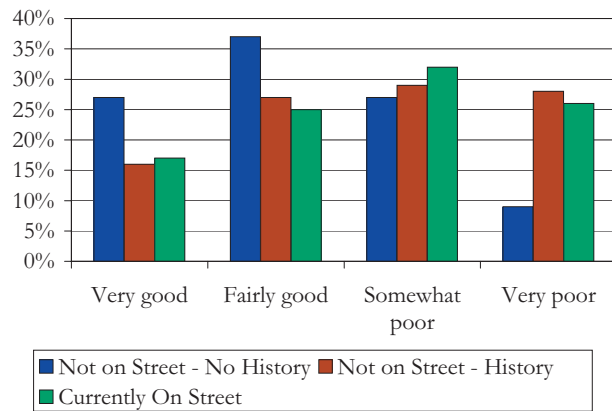
Figure 2: Conditions at Home by Current Level of Street Involvement *

Based on a sample of 332 street-involved youth in Calgary. * Significance level \leq 0.05